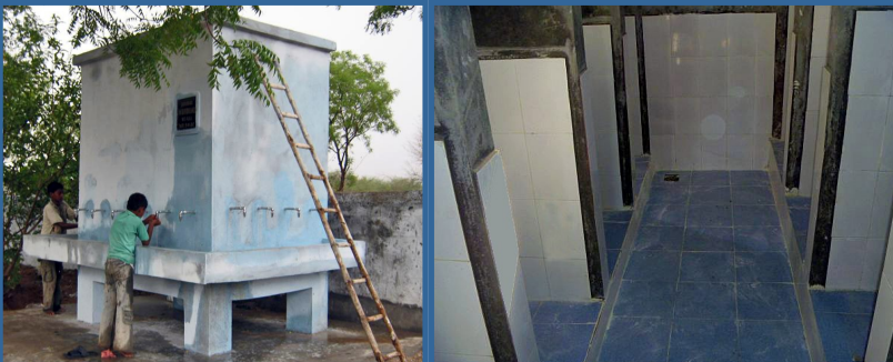
Marian water tank and Sneha toilets