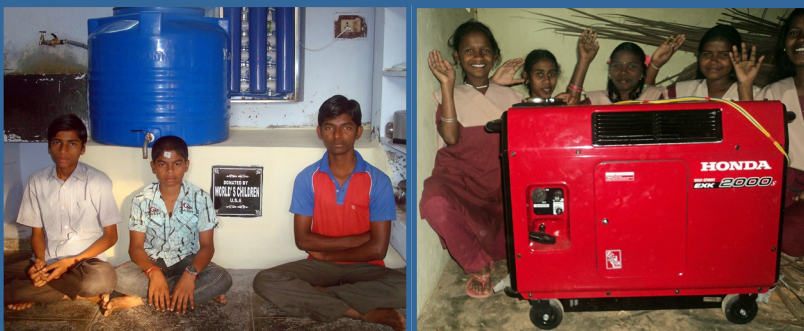
St. Mary's water filter and Happy Home generator