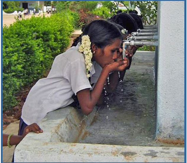
Marian girls enjoy drinking clean water from their new well and tank

At the time of the visit this home had just four working toilets for those 90 girls to use. Thanks to money donated by many of you during our fundraising campaign last fall the Sneha Sadan girls now have 17 toilets. That is what they are thanking us for in their letter from the first page. This isn't the only home where the children have a better life because of our fall campaign. Many orphanages have improved living conditions thanks to projects you funded or items you paid for them to purchase.