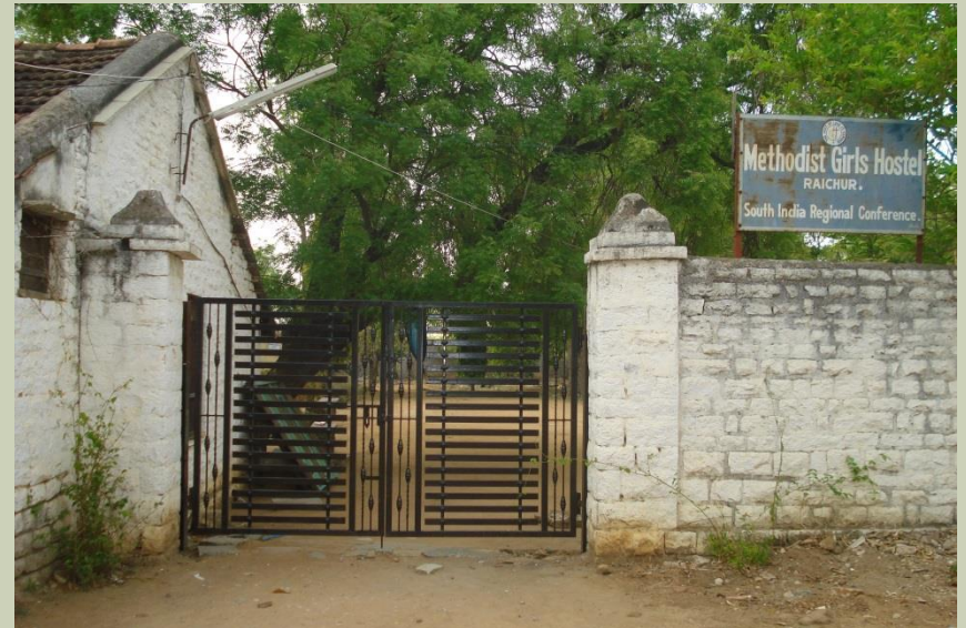
Raichur Girls' Hostel