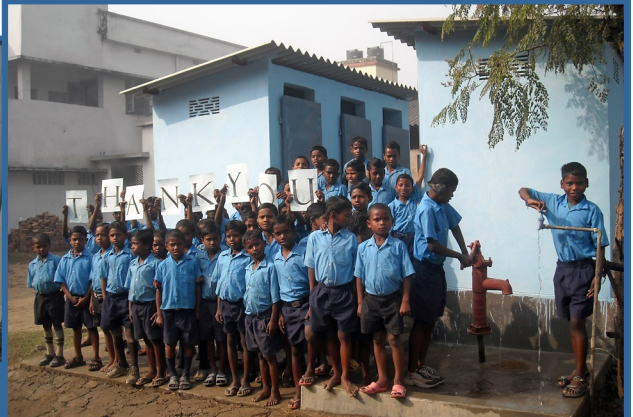
Katihar Boys' new toilet building and water pump