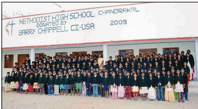
Children at the Methodist Boarding Home for Boys and Girls wearing sweaters provided by you.