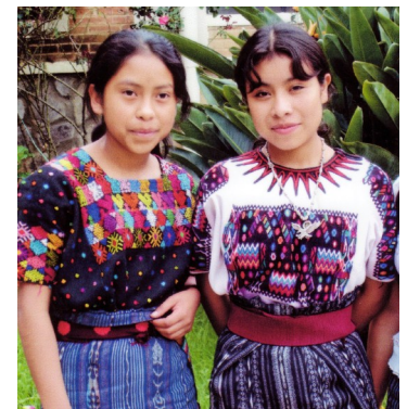
Child from Casa Hogar, Mexico (left) and two girls from Quiche Indian Mission, Guatemala (right)