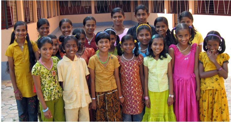
The sponsored girls at Infant Jesus Mission Home. Their smiles say "thank you, sponsors!"