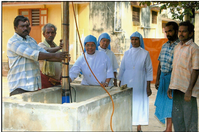
Little Flower Home for Children in India drilled a new well.