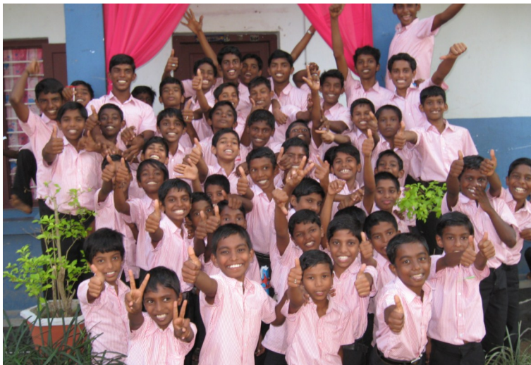
Boys will be boys (happy ones!) at St. Joseph's Boys' Home.

Life is better for our children thanks to you.