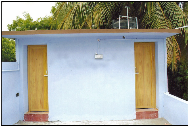
St. Joseph's Home for Children built this new toilet with the funds you provided.